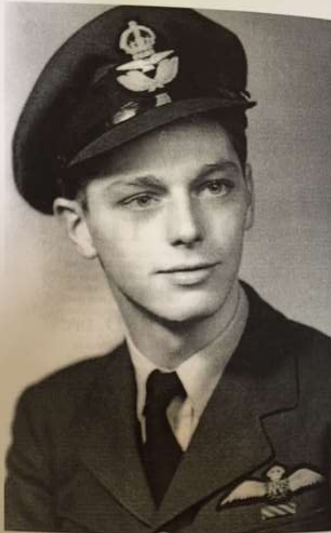
The author in 1944.